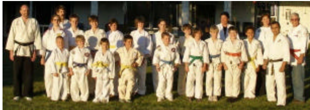
Jujitsu Lessons with Great Instructors